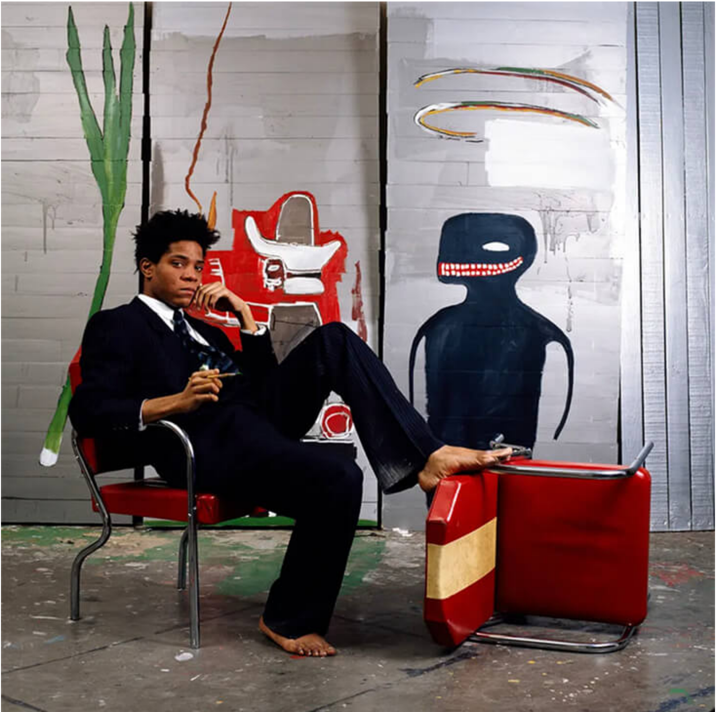
Jean-Michel Basquiat wearing Giorgio Armani, seating in front of his work.

Before making his name as an artist, Basquiat found early success with a series of hand-painted clothes under the label 'Man Made.' Using items of clothing found on the street, including sweatshirts, lab coats and jumpsuits,